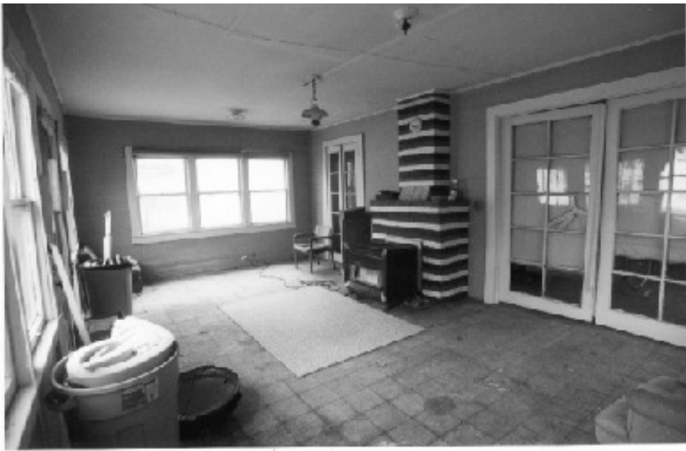
Old Living Room